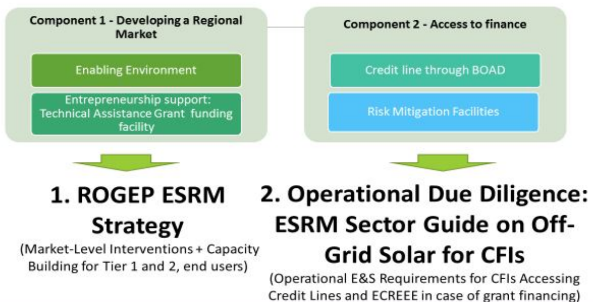
Figure 3. Key Components of the ROGEP ESRM Strategy